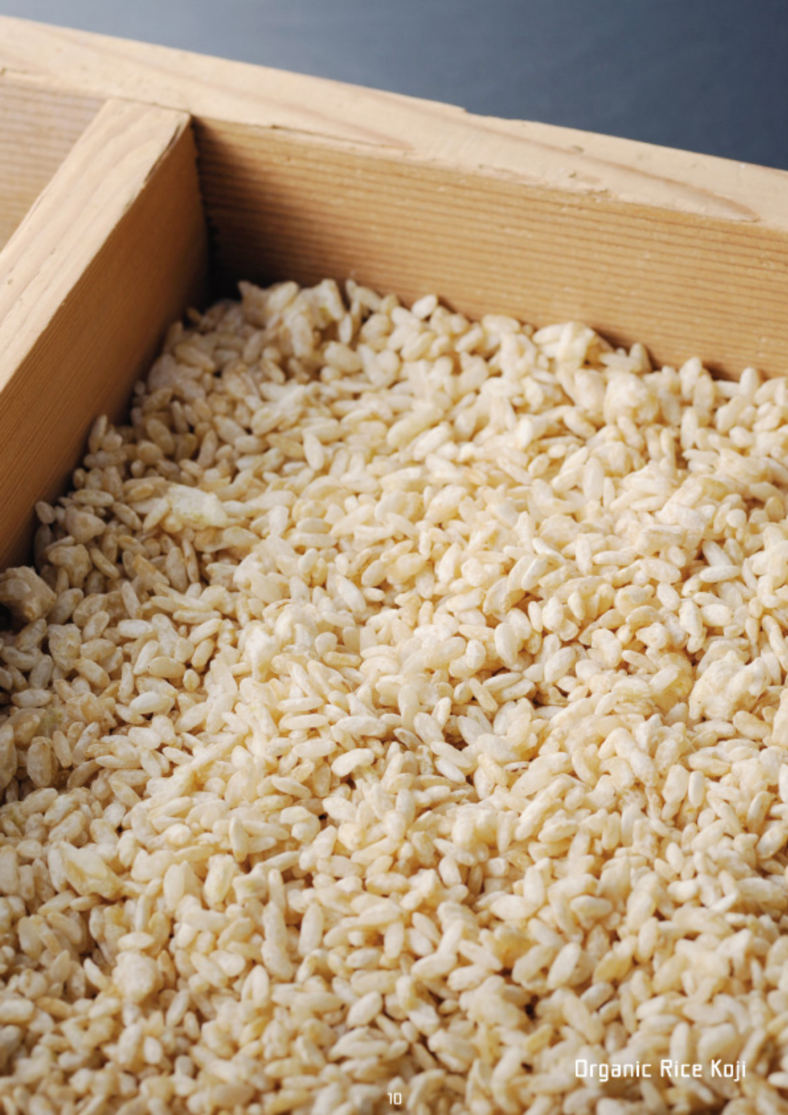
Organic Rice Koji